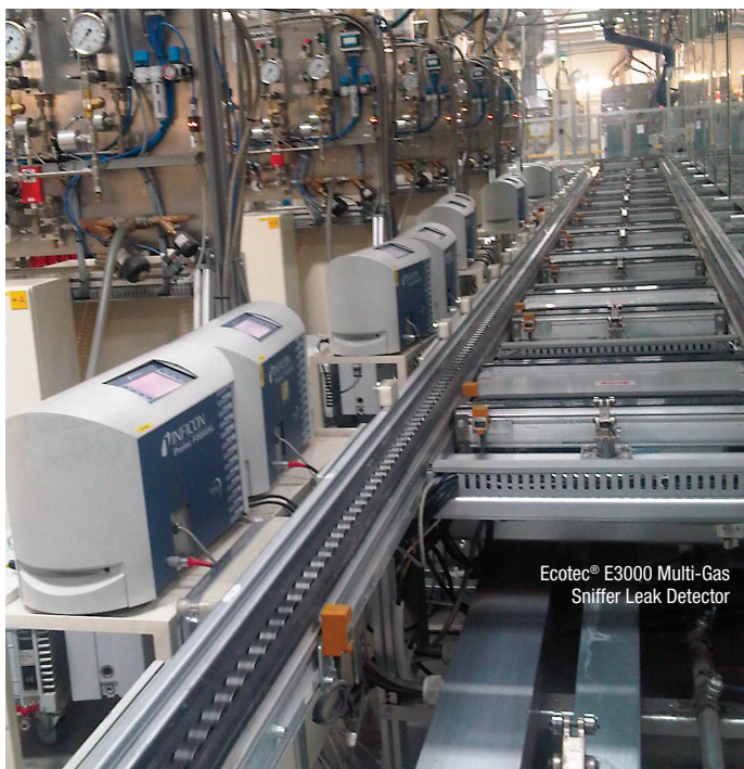
Ecotec® E3000 Multi-Gas Sniffer Leak Detector

products for service technicians includes innovative refrigerant leak detectors, combustible gas leak detectors, ultrasonic leak detectors, refrigerant recovery scales, and vacuum pressure gauges. With INFICON service tools, you are assured of having the right tool to get the job done quickly and accurately, saving you time and money.