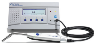
Sensistor® ISH2000 Hydrogen Leak Detector

INFICON refrigerant, hydrogen and helium leak detectors are the worldwide leading brand for quality control at refrigeration, air conditioner, appliance, and automotive manufacturing facilities and their supply chains.