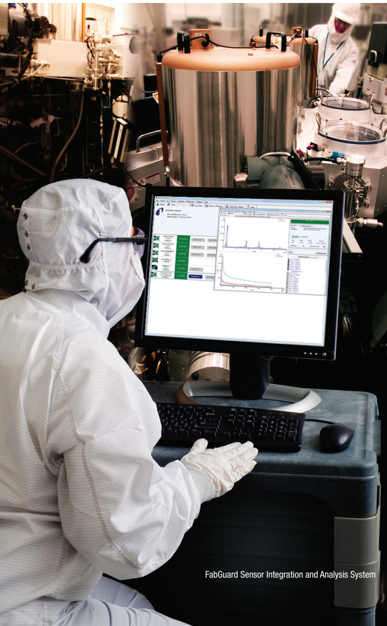
FabGuard Sensor Integration and Analysis System