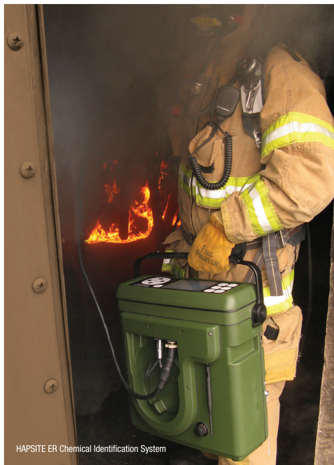
HAPSITE ER Chemical Identification System

Photovac™, an INFICON Brand, products include handheld, portable and rack mounted instruments based on photoionization detection, flame ionization detection and gas chromatograph technology and are used by emergency and environmental response teams around the world.