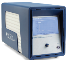
Micro GC Fusion Gas Analyzer

INFICON instruments are used in oil and gas production, hydrocarbon processing, refining, and chemical productions. From research and development to production, we are investing in gas analysis technologies to help enable you to operate more efficiently. Through better understanding of raw materials, process control of intermediates or the quality of final products, INFICON offers small, transportable,