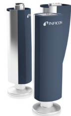
Porter™ Capacitance Diaphragm Gauge

INFICON vacuum gauges provide precise pressure measurement and control throughout the vacuum range. Our ceramic capacitance diaphragm gauges deliver higher stability and longer life in many industrial processes. INFICON combination gauges combine multiple measuring principles in a single unit for wide and accurate pressure control and monitoring.