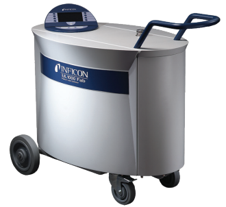
UL1000 Fab Helium Leak Detector

Our helium leak detectors meet the most critical and demanding leak checking applications. Defining speed and accuracy in leak detectors, these highly sensitive products offer testing flexibility in all measurement ranges.