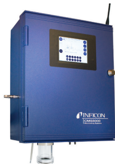
CMS5000 Air Monitoring System

For continuous, unattended remote monitoring of water or air, the CMS5000 Monitoring System uses GC technology to analyze Volatile Organic Compounds