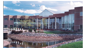
INFICON manufacturing locations include Germany, Liechtenstein and the United States.

INFICON is a publicly traded company on the SIX Swiss Stock Exchange under the symbol IFCN.