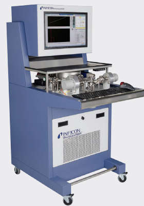
Pernicka™ 700H Cumulative Helium Leak Detector