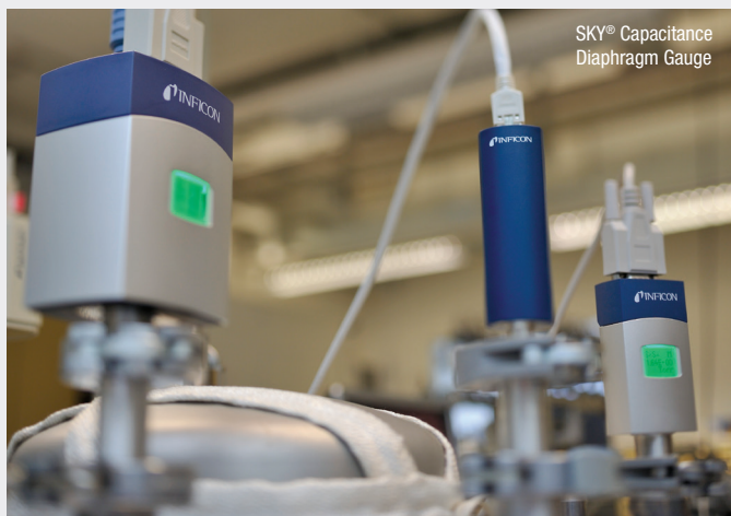
SKY® Capacitance Diaphragm Gauge

INFICON offers the world's widest range of vacuum gauge principles spanning over 15 decades of vacuum pressure measurement, enabling users in a variety of vacuum applications to reliably monitor gas pressures during manufacturing or research processes.